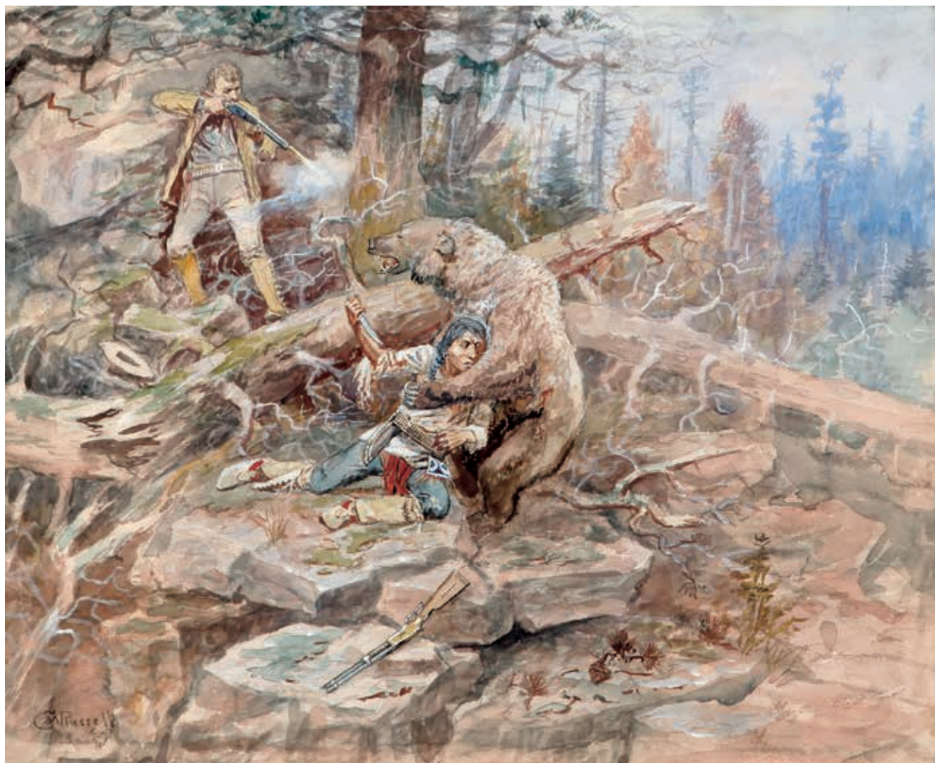
Charles M. Russell (1864-1926), In the Nick of Time , watercolor, 18 x 22". Estimate: $250/350,000