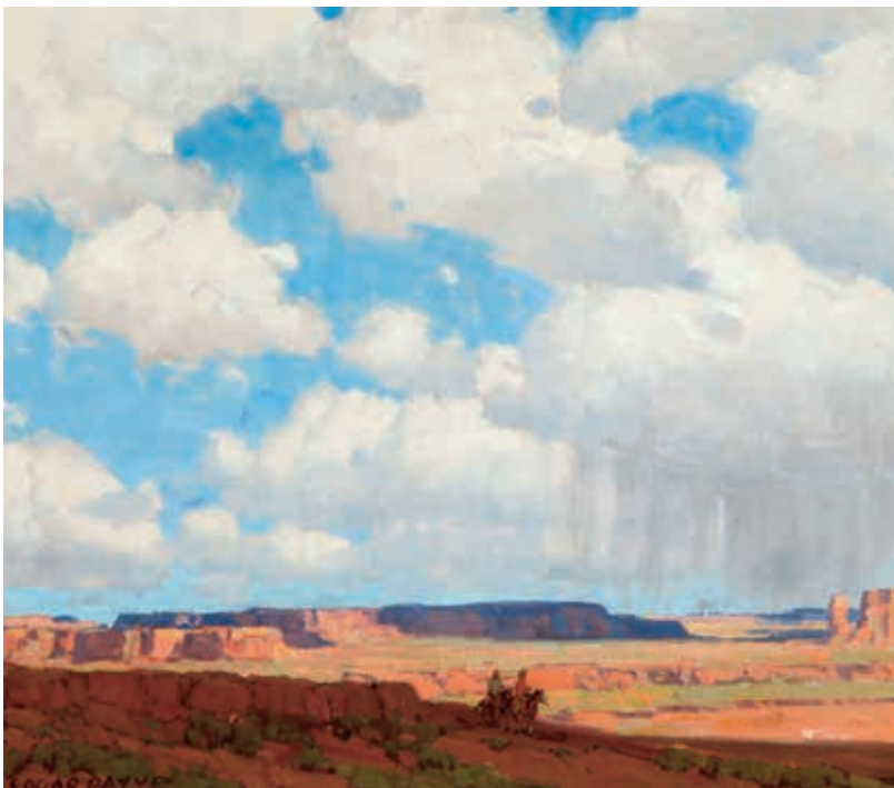
Edgar Payne (1883-1947), Desert Skies , oil on canvas, 30 x 34". Estimate: $200/300,000