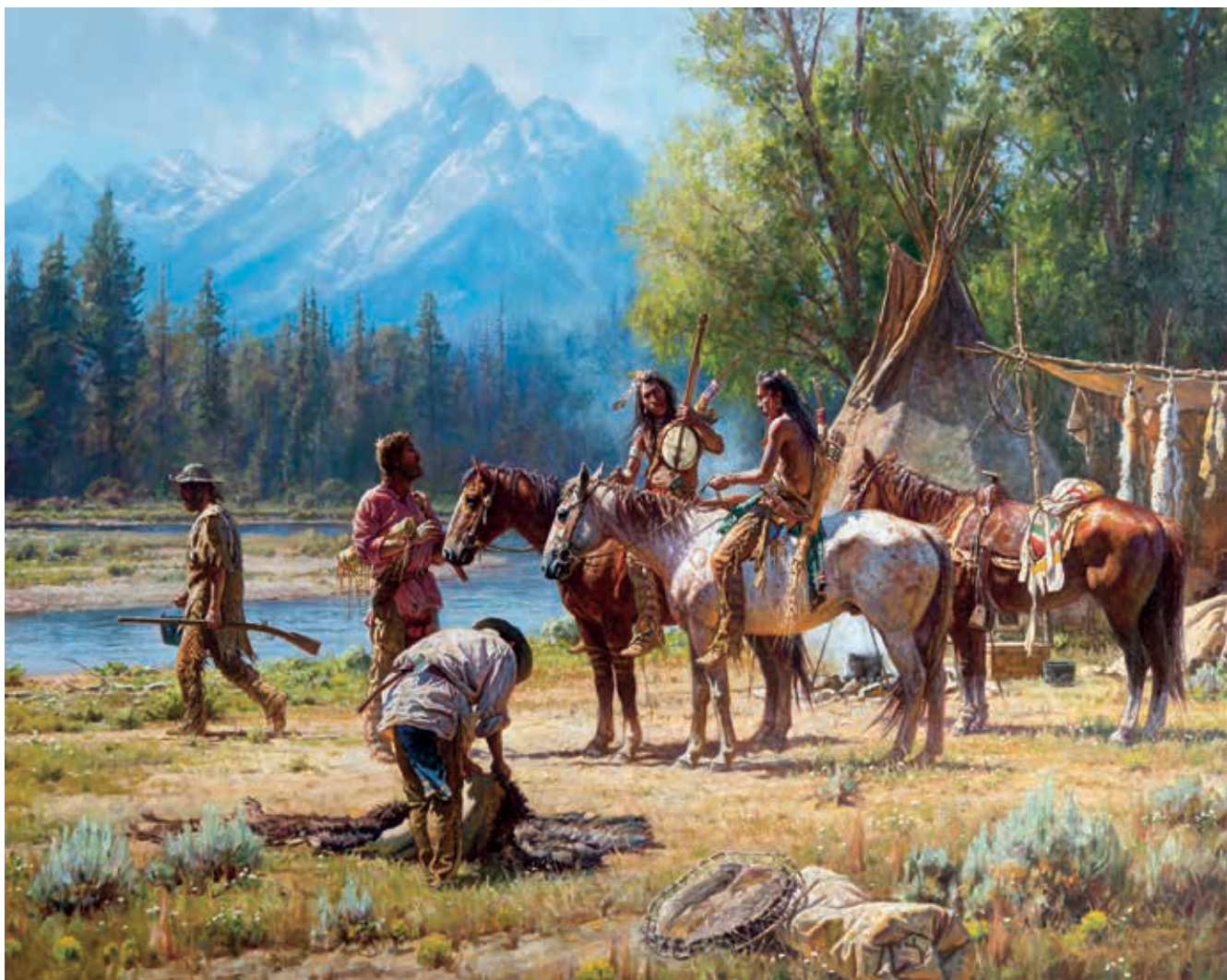
Martin Grelle, Snake River Culture , oil on canvas, 48 x 60". Estimate: $300/400,000