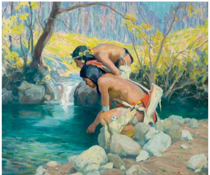
Eanger Irving Couse (1866-1936), Trout Stream , oil on canvas, 20 x 24 1/4" Estimate: $125/175,000

The top Houser piece is likely to be Smoke Signal , a 57-inch-tall bronze figure with a variety of textures on the figure's skin and clothing, estimated to sell between $100,000 and $200,000. If it falls within those ranges it