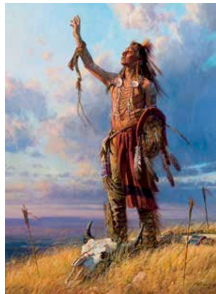
Martin Grelle, Warrior's Prayer , oil on canvas, 48 x 36" Estimate: $125/175,000