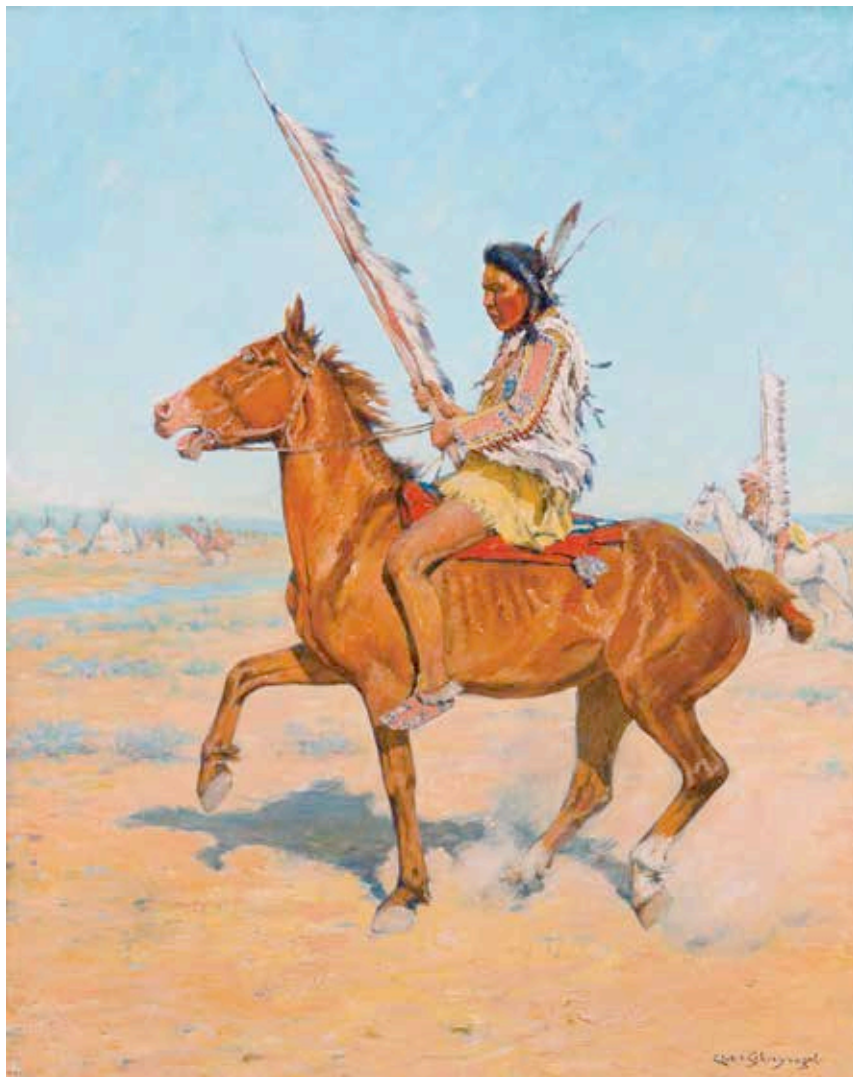
Charles Schreyvogel (1861-1912), Mounted Indian Warrior , oil on canvas, 20 x 16" Estimate: $225/325,000