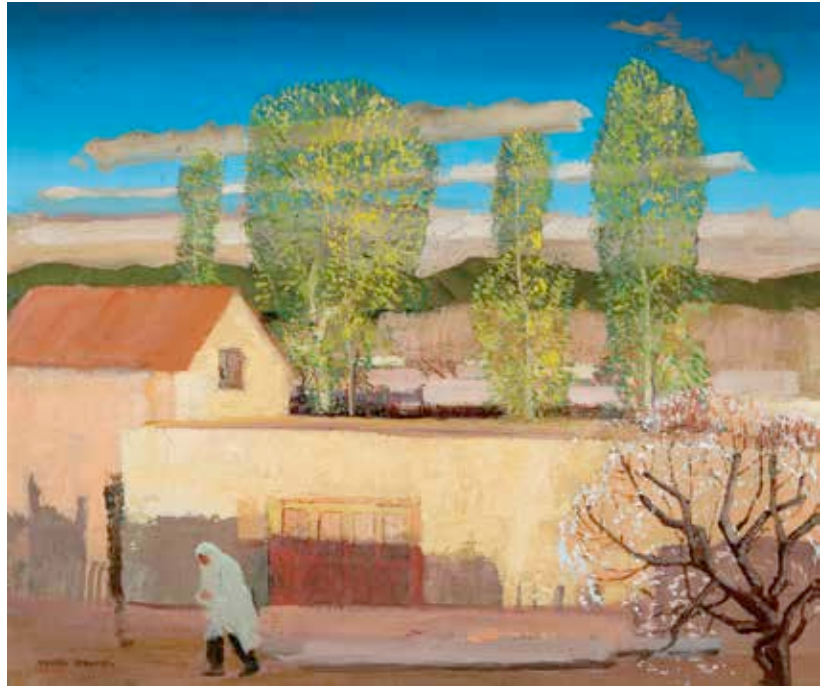
Victor Higgins (1884-1949), The Red Door , oil on canvas, 20 x 24" Estimate: $200/300,000

On April 2, the Scottsdale Art Auction will bring to bidders an impressive array of artworks ranging from thrilling cowboy imagery to tranquil scenes of Native American life in Taos, New Mexico. The sale will attempt to top last year's sales total of $13.7 million, its second best total in the history of the auction.