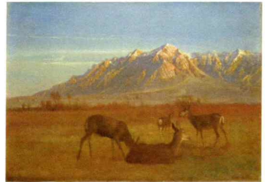
Figure 1 Bierstadt, A Mountain Range, with Black-Tailed Deer , oil on paper, 13 x 18 5/8 in., Buffalo Bill Center of the West, Cody, Wyoming

Albert Bierstadt Catalogue Raisonné Project